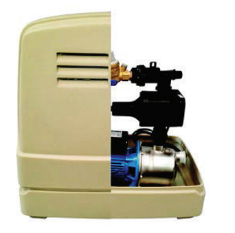
Surface Mounted Pump With Cover

RainWorx® Pump Kits for Above Ground Tanks